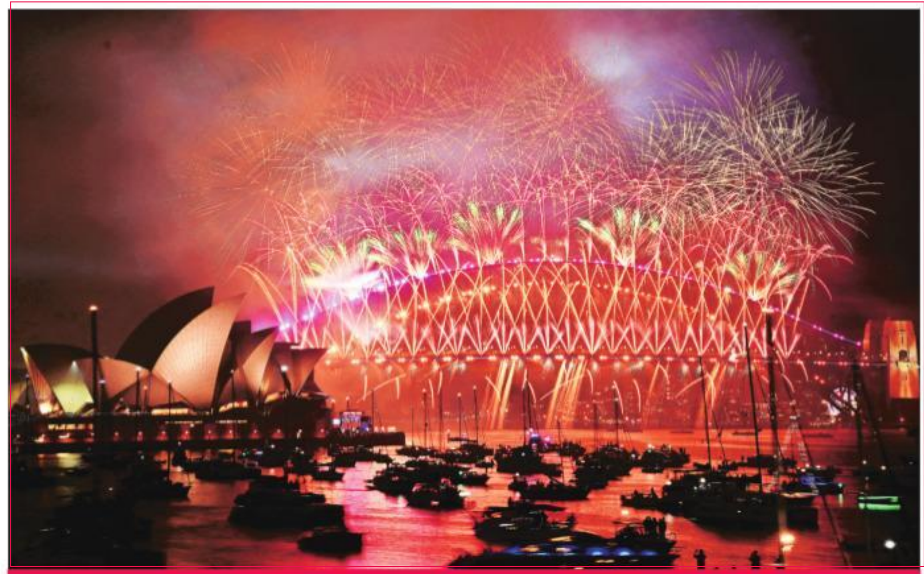
Fireworks are seen over the Sydney Opera House and Harbour Bridge during New Year's Eve celebrations in Sydney, on Sunday.